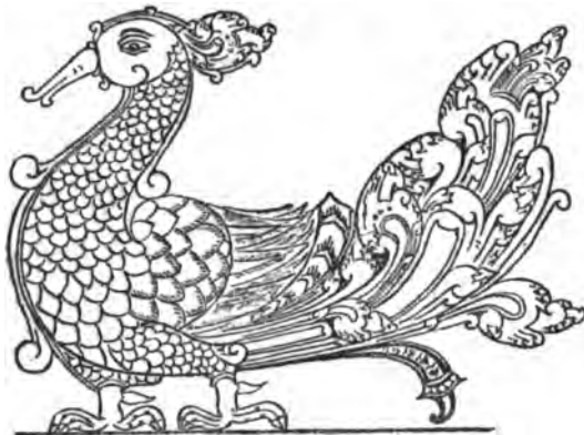
Fig. 4, Hansa , ( \times \frac{1}{2} ), from a padimakada pata (modern).

The pupil is also taught to draw repeating patterns with a geometrical construction (Fig. 5), and the different types of conventional floral ornament made use of in Sinhalese design. These by the way vary a little in different families, wherein they are traditionally transmitted from generation to generation. The types of tiringi talai also vary slightly. There is some opportunity for individuality here; it should not be supposed that the strictly traditional character of the arts makes it impossible to distinguish one man's work from another's.